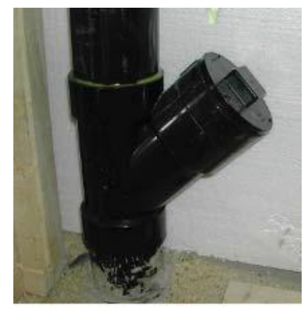
Domestic Meter <<Water Valve>>